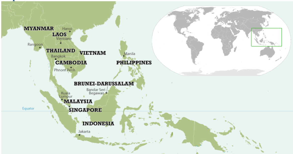
Map 1. Southeast Asia and the Ten ASEAN Member States 22

The Association of Southeast Asian Nations (ASEAN) was founded in 1967 by Indonesia, Malaysia, the Philippines, Singapore, and Thailand with the goal of accelerating economic growth, social progress and cultural development and promoting peace and stability in the region. 23 Founded during the Cold War, ASEAN supported non-intervention in internal affairs among its member states, many of which were ruled by authoritarian or semi-authoritarian regimes during that time. After the end of the Cold War, ASEAN expanded by admitting Vietnam (1995), Laos, Myanmar (1997) and Cambodia (1999) 24 and has since worked to deepen regional cooperation in economic issues and free trade, environmental concerns and human rights. These efforts culminated in the entry into force of the ASEAN Charter on December 2008, which gave the organization a new legal framework and a number of new organs. 25 One aim is the creation of an ASEAN community by 2015.